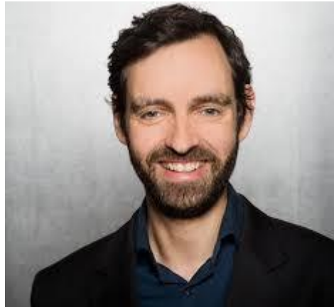
Guillermo Orts Communications